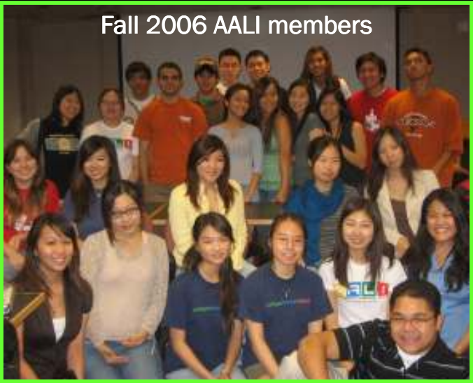
Fall 2006 AALI members